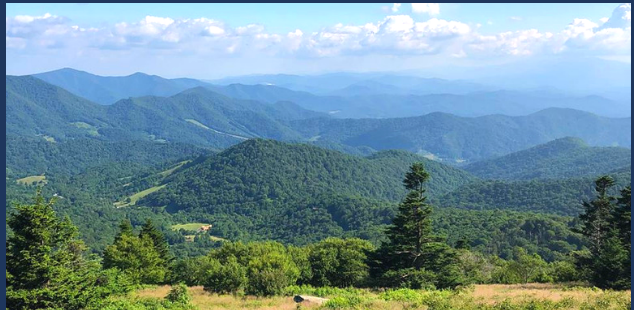
Roan Mountain 4